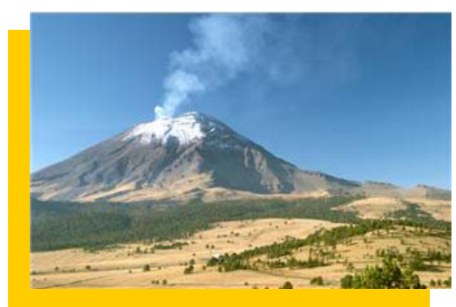
Plate tectonics is a unifying geologic theory that explains the formation of major features of Earth's surface and important geologic events. Sixth-grade students learn about the evidence of past plate tectonic movement and about landforms and topographic features—such as volcanoes, mountains, valleys, and mid-ocean ridges—generated by plate movement. They discover that major geologic events, such as earthquakes, volcanic eruptions, and mountain building, result from plate movement and often occur at the boundaries of the plates.

Students also learn that Earth is composed of three distinct layers: the lithosphere, the mantle, and the core. They understand that the flow of heat and material within Earth drive the movement of lithospheric plates, and they apply an understanding of plate tectonics to explain the major features of California geology.